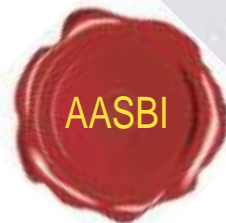
Secretary - Treasurer