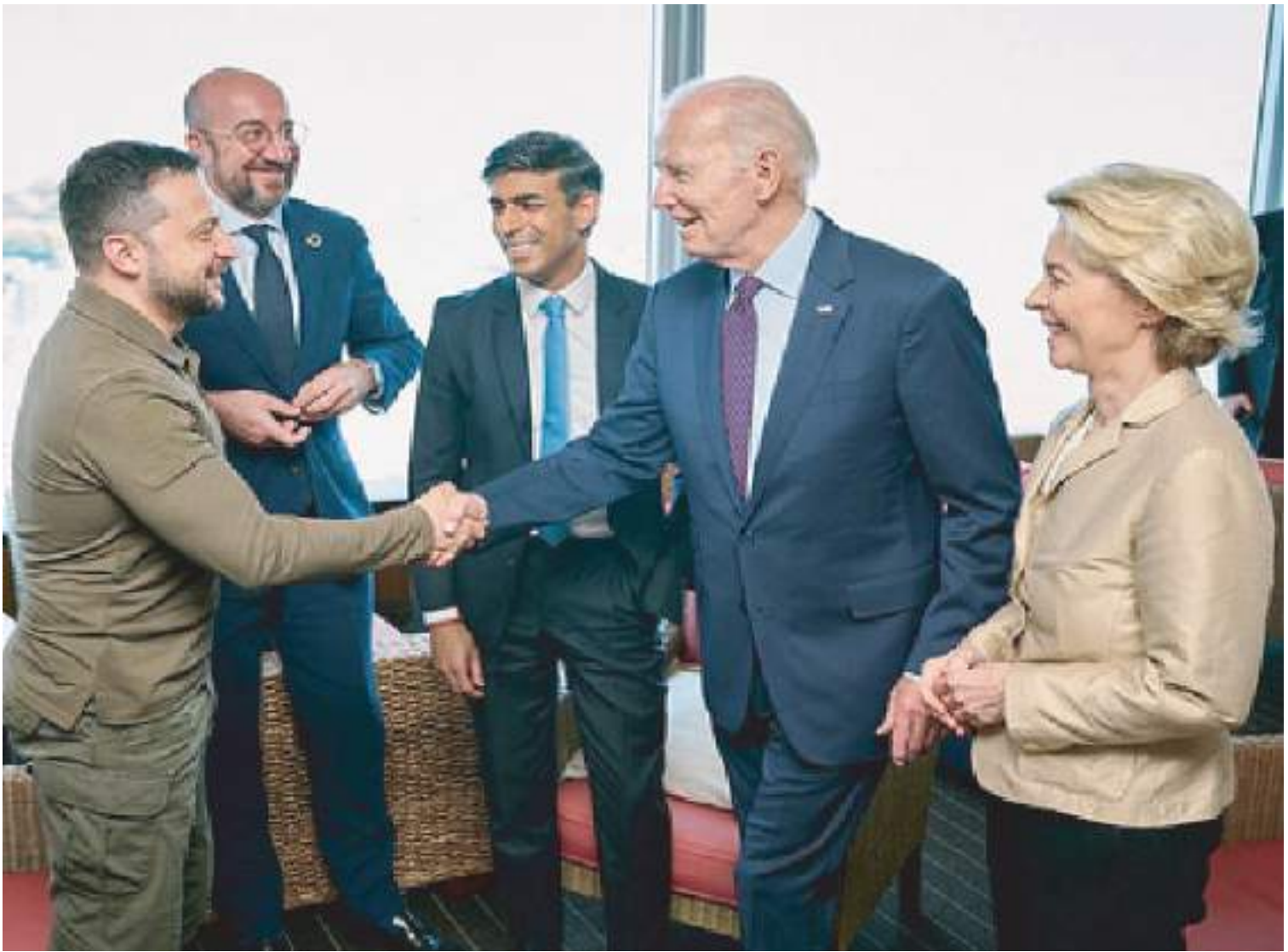
Volodymyr Zelensky, (Ukraine), Charles Michel (President of the European Council), Rishi Sunak (PM UK), Joe Biden of the President USA, Ursula von der Leyen (President of the Union Commission). At House Democrats by of the Congressional Progressive, May 2023.